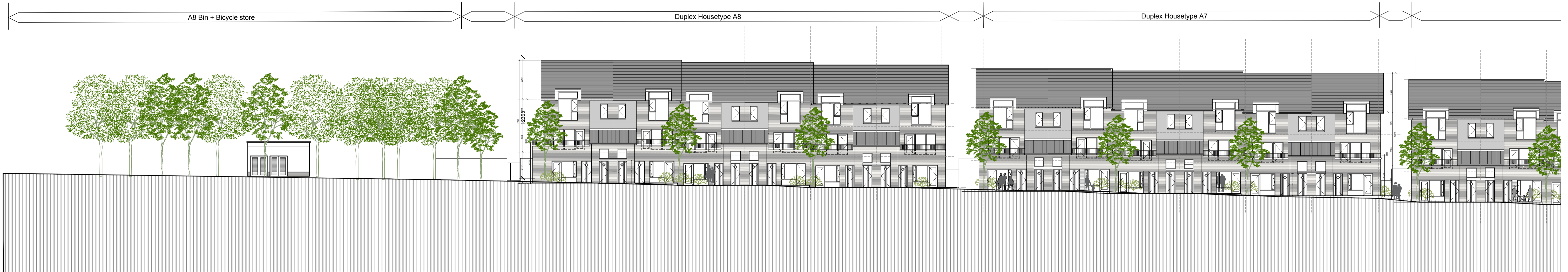
SITE SECTION F-F 1:200