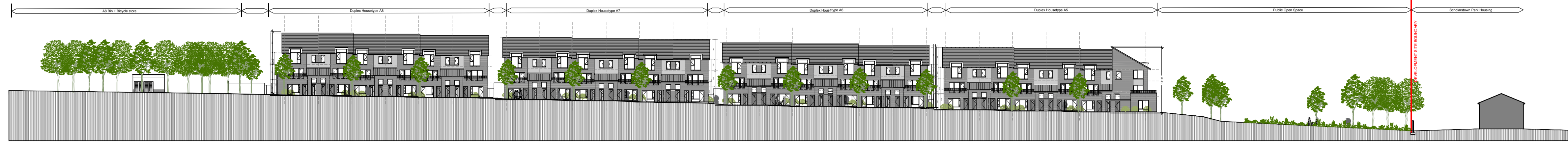
SITE SECTION F-F 1:500