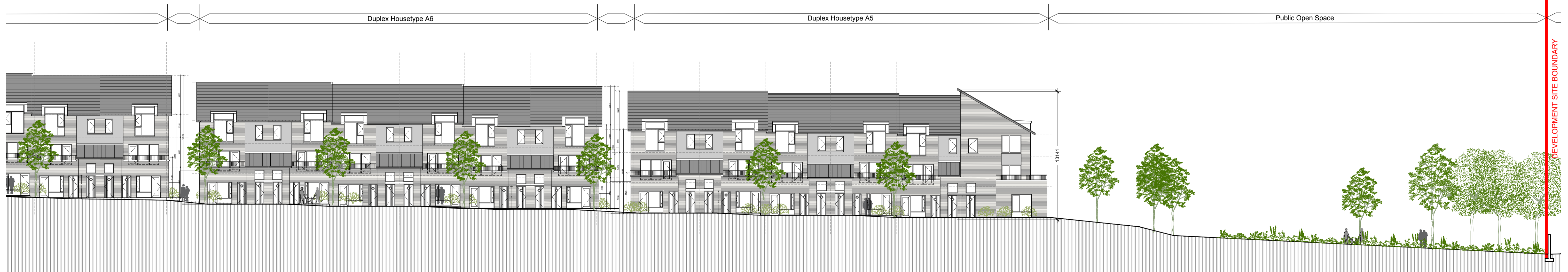
SITE SECTION F-F 1:200